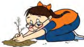
planting a tree