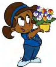
making things for those in need